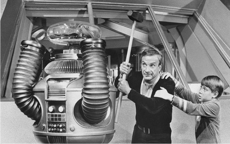
A typical Novacon planning discussion!