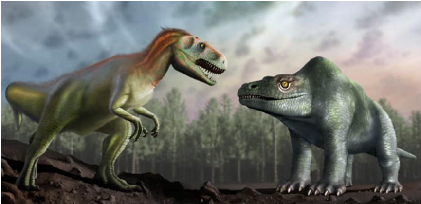
Artist's impression of how Victorian palaeontologists thought Megalosaurus bucklandii looked (right), compared with how we now understand it to have looked (left).

While dinosaurs as such are science fact, they have always featured in SFF stories, starting from early examples such as A JOURNEY