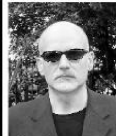
Jon Courtenay Grimwood

Author of End Of The World Blues , 9Tail Fox and The Arabesk Trilogy